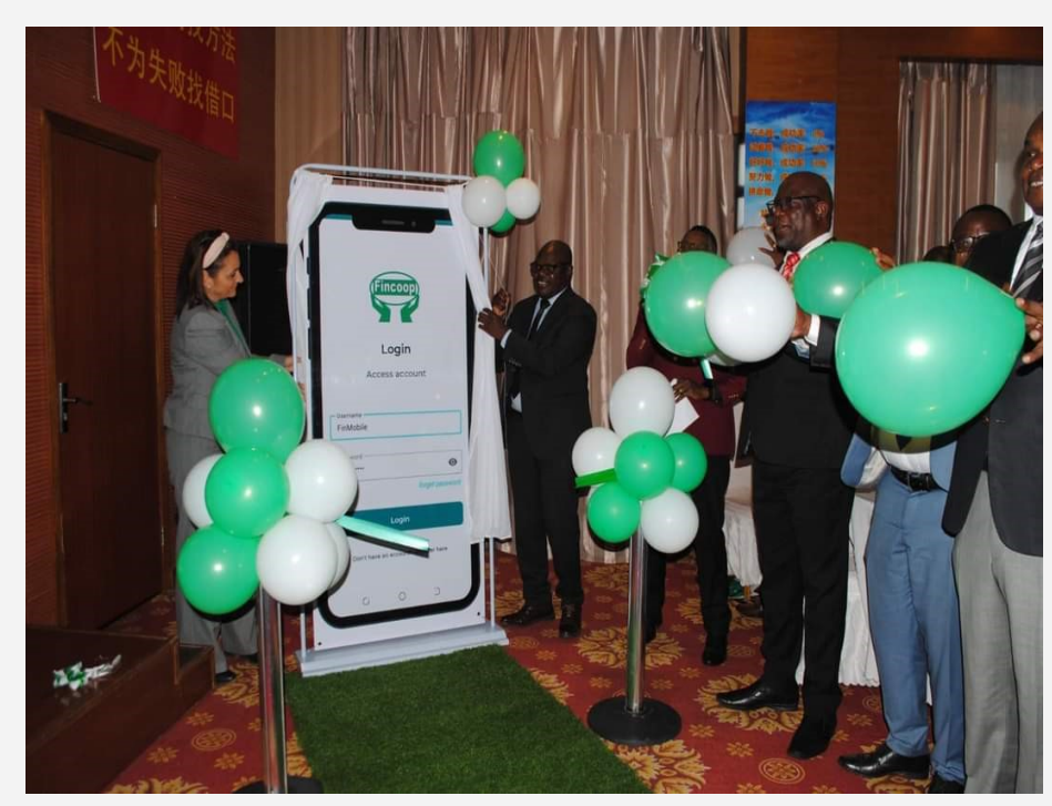
Figure 3: Unveiling of the App

In a quest to boost its service deliv-FINCOOP SACCO has ery, launched its first ever mobile application. FinMobile Application is a success for the sector as a whole, as it solidifies the sectors' goal in being Technologically competitive and symbolizes growth. The Application, allows FINCOOP SACCO members and prospect members to transact in the comfort of their home. Some of the features are: account opening & registration, Deposits, account balance checking, loan application, access to ministatements, and many more!