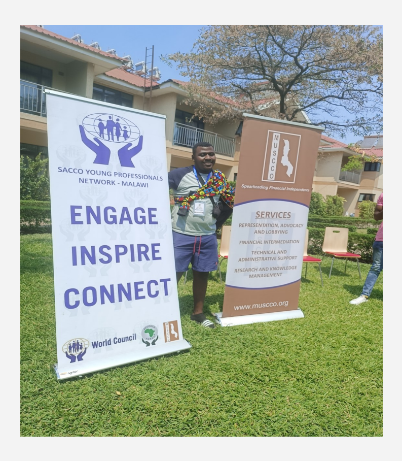
Figure 5: One of the Young Professionals at conference