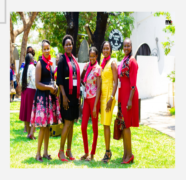
Figure 2: Participants Posing for a picture

The GWLN Malawi Sister Society is dedicated to propelling women into leadership positions, offering a vibrant platform for female professionals working with Savings and Credit Cooperatives (SACCOs) to connect and share experiences.